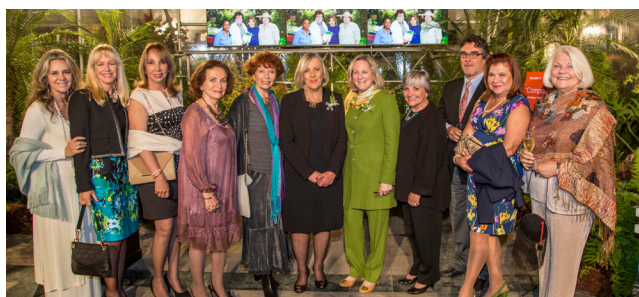
Peruvian Club members and dignitaries with President Robinson

A PHOTO ALBUM CONTAINING A FULL DESCRIPTION OF THE VISIT TO PERU AND FLOWER SHOW IS ON THE NATIONAL GARDEN CLUBS' FACEBOOK PAGE .