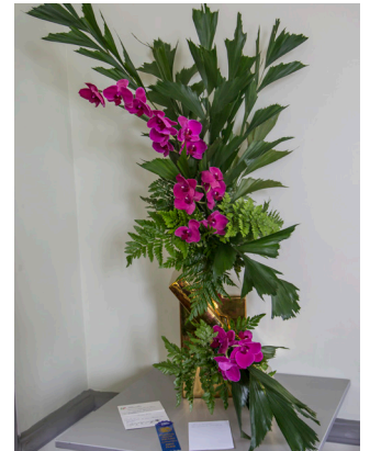
Designer's Choice by Isabel Grieve