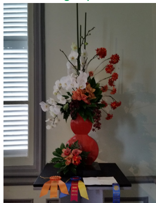
Creative Design by Renata Cuneo Traditional Design by Itala Testino