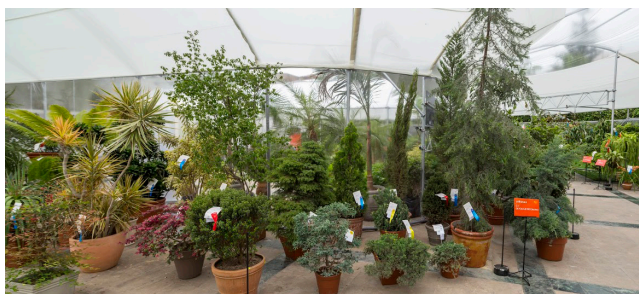
Herbaceous Section of the Flower Show