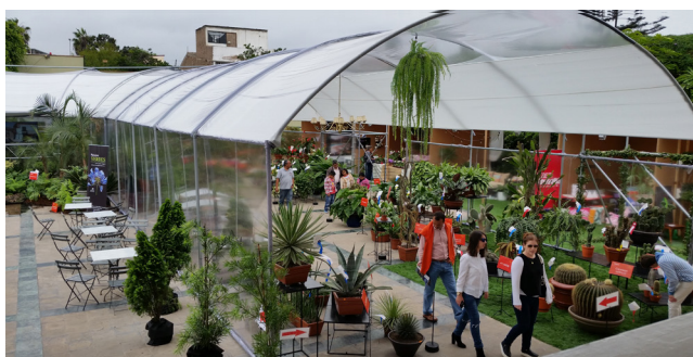
A portion of the Horticulture Division outside the Museum