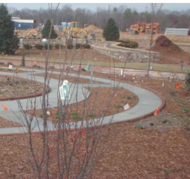
The garden at the start of Phase 3 of the project in March 2011. The pavers have been placed, soil preparation completed and herbs and shrubs planted.