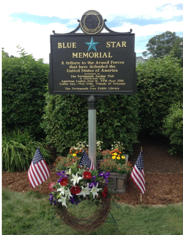
Blue Star Memorial Marker in Portsmouth