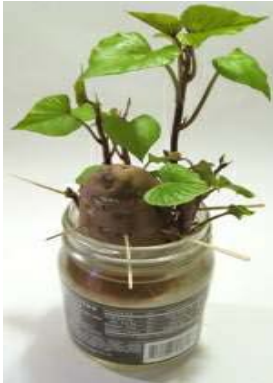
Sweet Potato - toothpicks in place