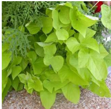
Fully grown vine.