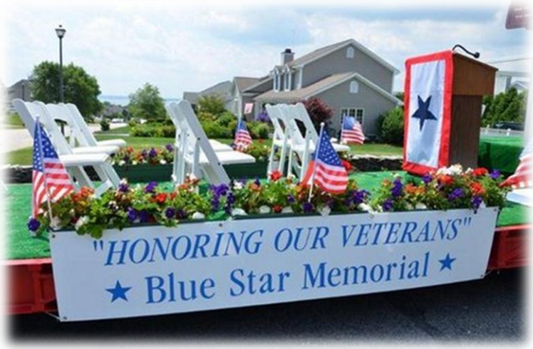
Bristol 4 th of July Float Pictures